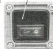
On / Off switch